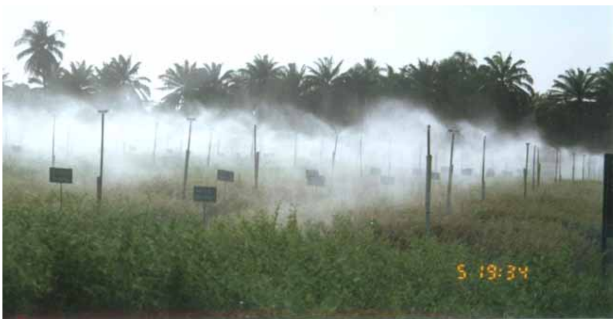
Figure 2. Field screening technique, Ishurdi, Bangladesh.

for 12–24 h and inoculated following standardized procedures as explained above. The experiment was conducted in two replications with eight twigs in each replication and repeated once.